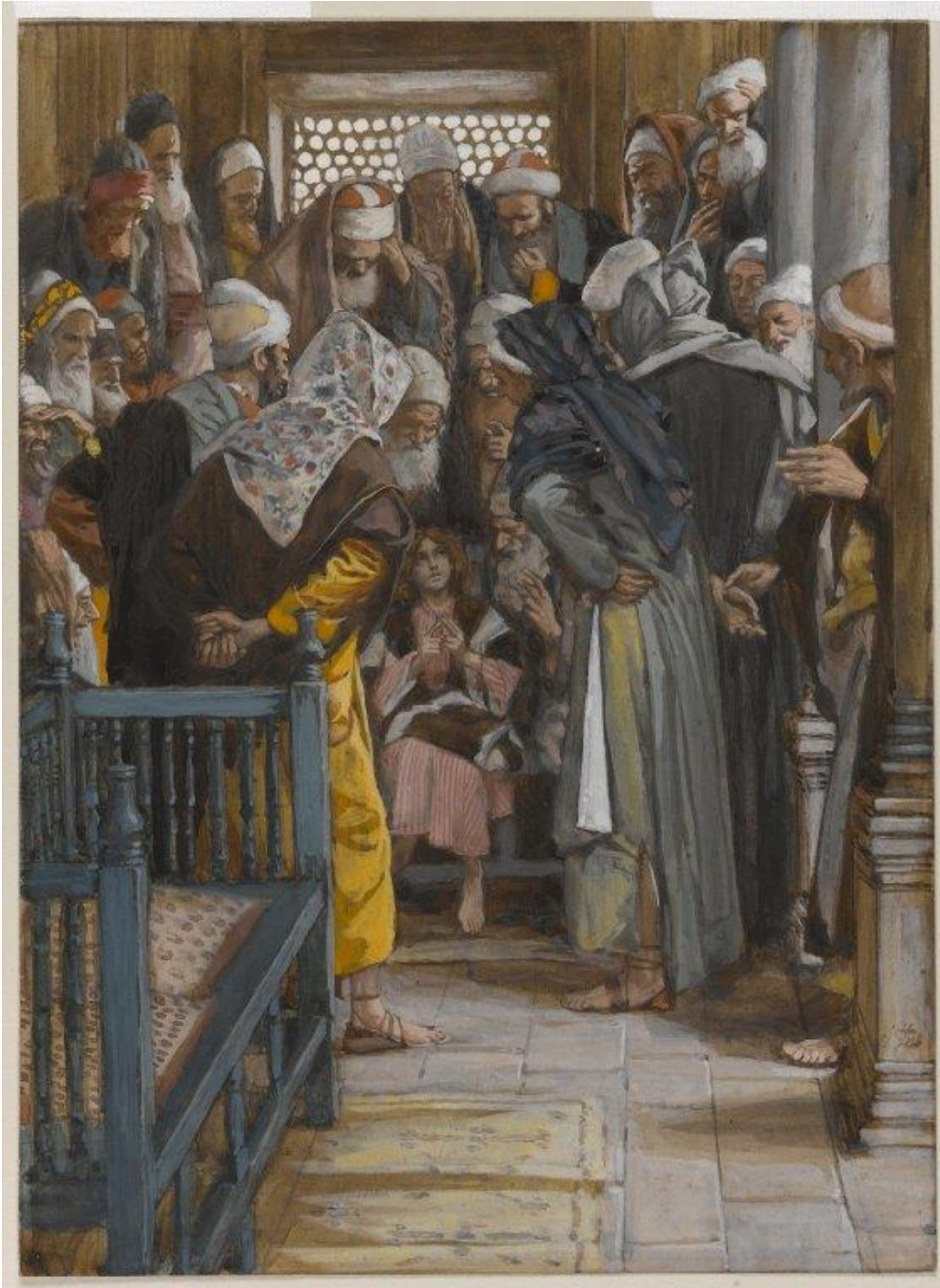
The Child Jesus in the Temple, James Tissot, about 1890.