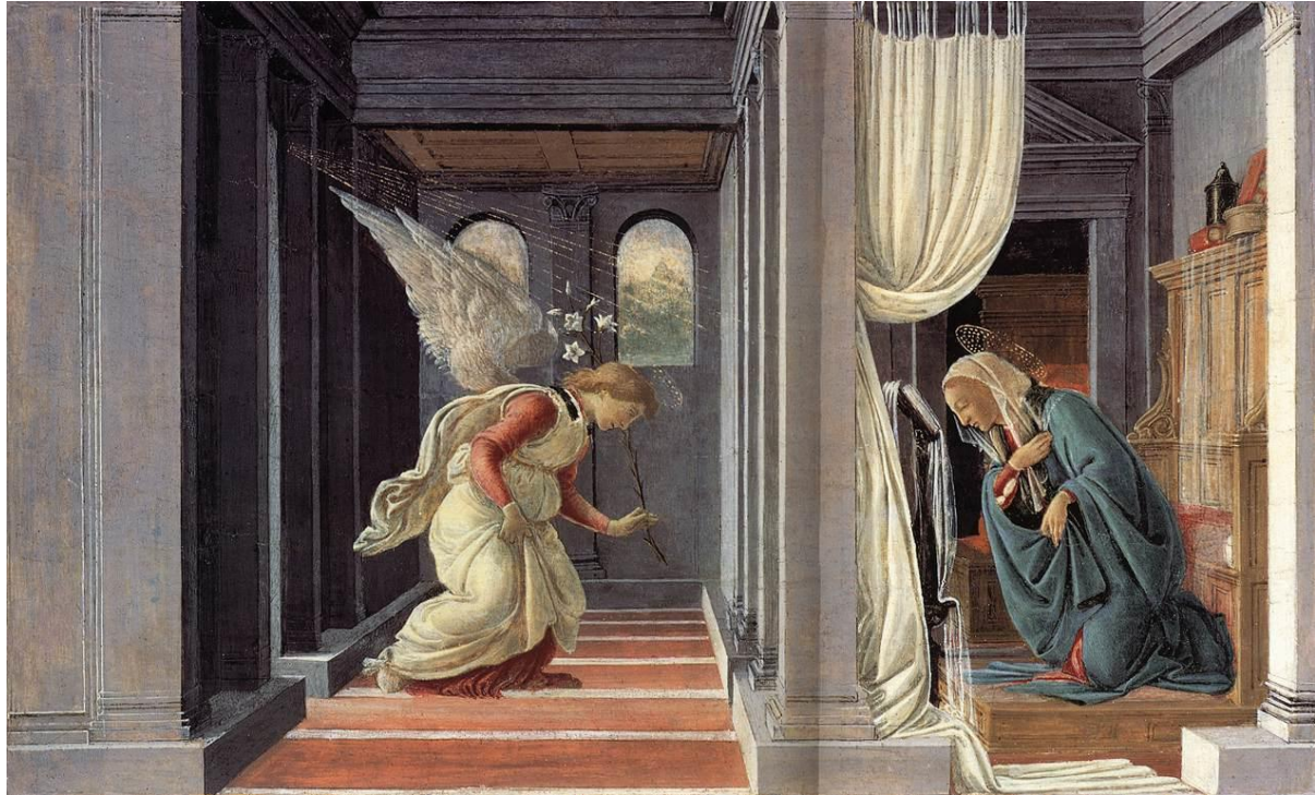
The Annunciation, Botticelli, 1485

Later legends about St. Luke suggest that he was an artist. Unquestionably his “artistic” narratives have inspired artists throughout the ages.