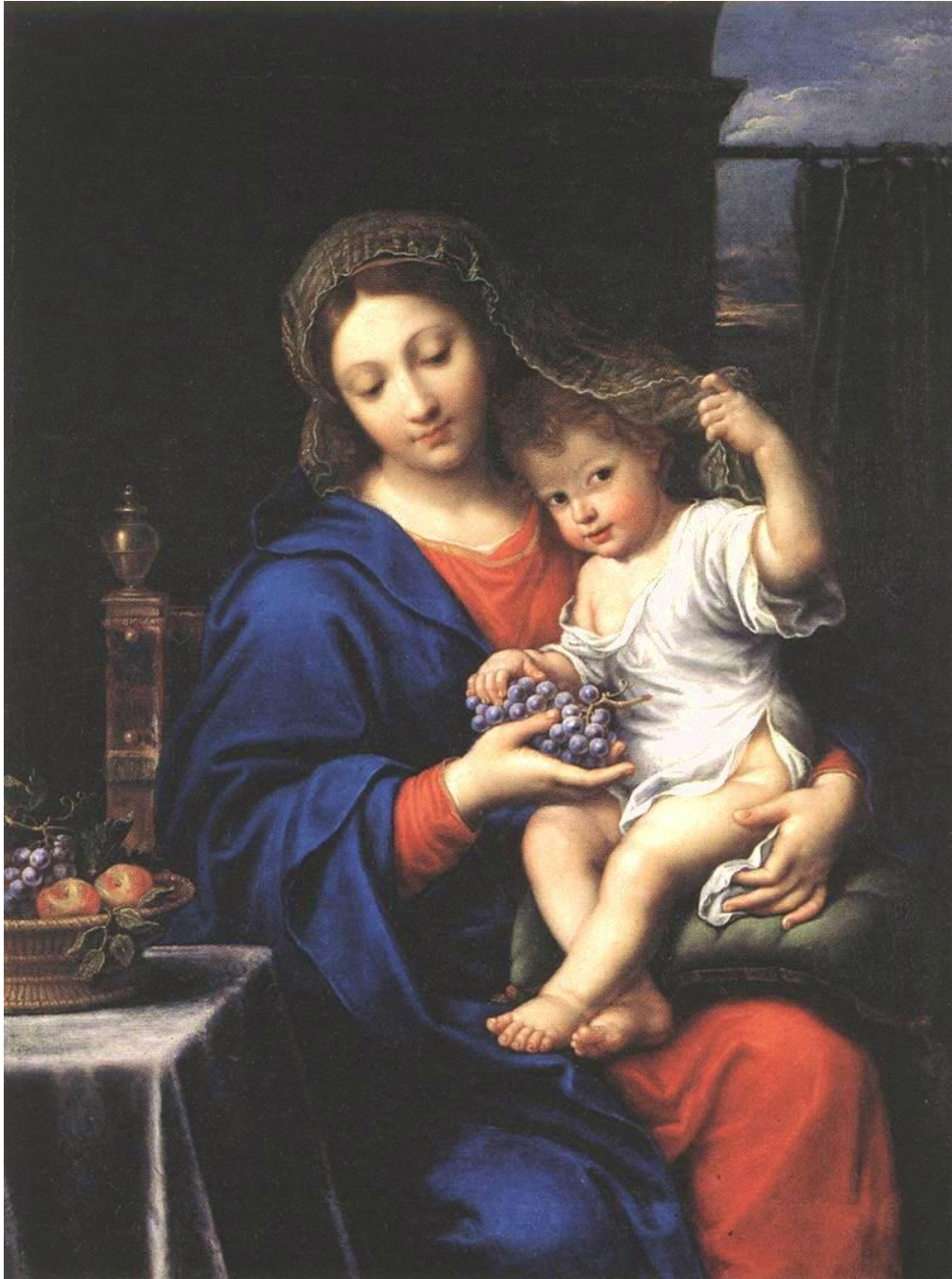
Madonna of the Grapes, Pierre Mignard, about 1640.