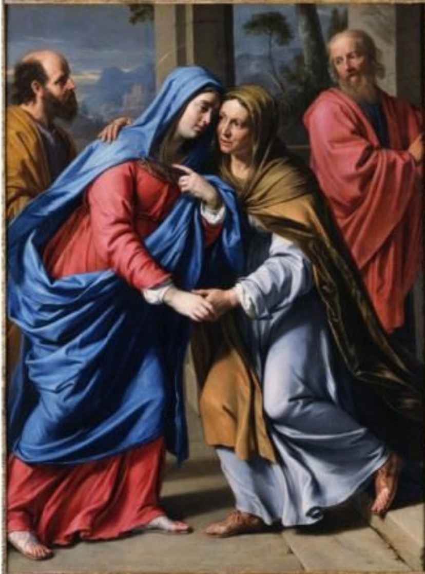
The Visitation, Philippe de Champaigne, about 1645.