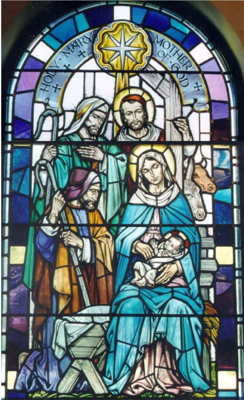
The Birth of Jesus, Stained Glass at Our Lady of Peace, N.B., 1992.

In the Middle Ages, when books were rare, Churches used their stained glass windows to illustrate the biblical stories read to the parishioners at Mass.