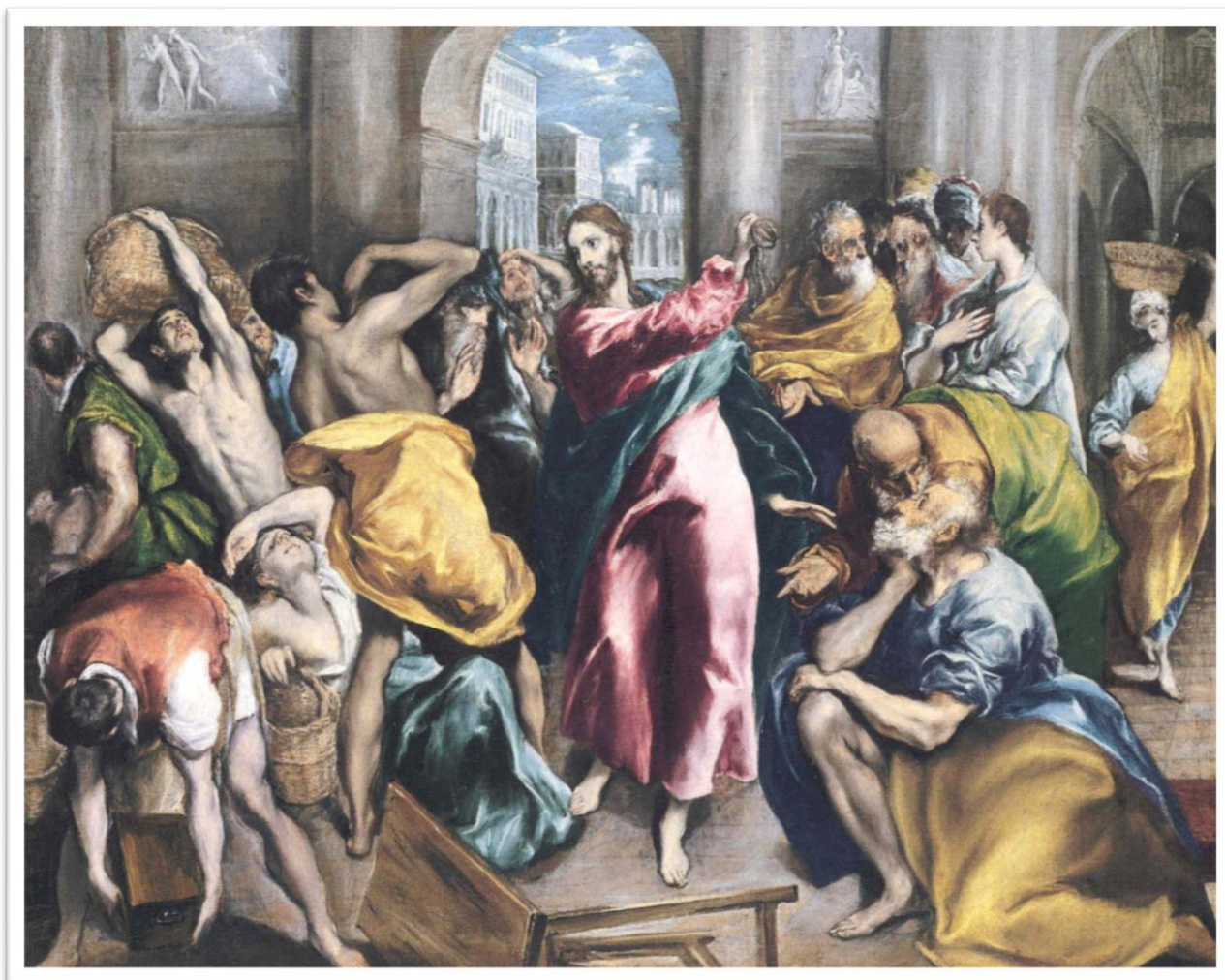
Cleansing the Temple, by El Greco.