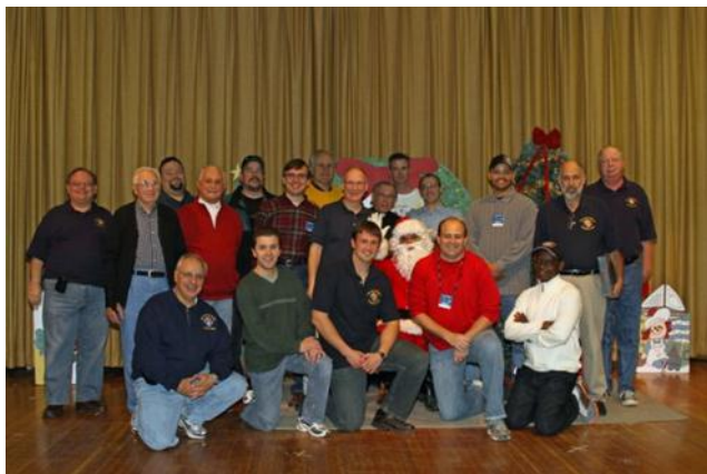
(Santa and the Knights ...)