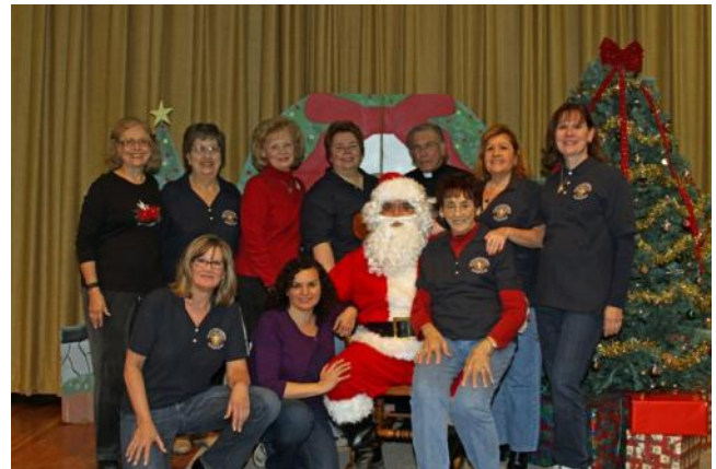
Santa and the Columiettes.....

As always, our event was a success through the combined efforts of our brother Knights and the Columbiettes !!