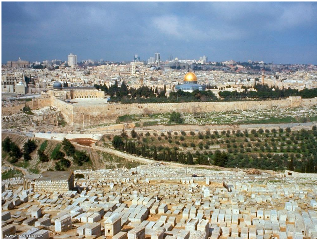
A closer picture of the Temple platform from the Mount of Olives. See below.