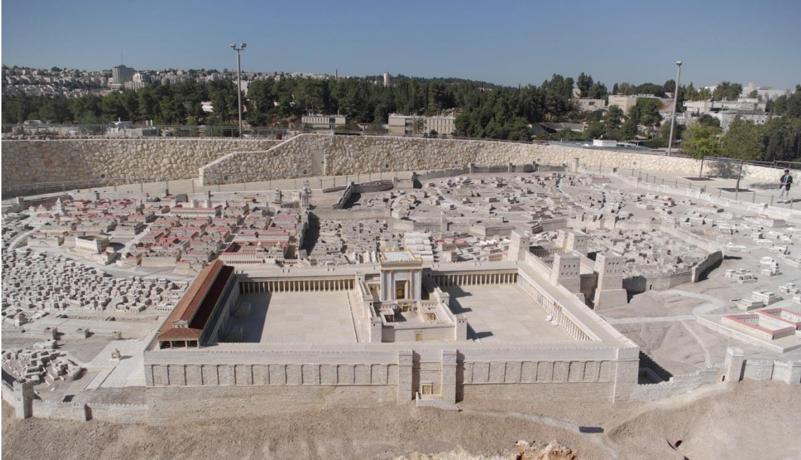
A model showing the Temple platform and the Temple as it would have looked at the time of Jesus, seen from the Mount of Olives.